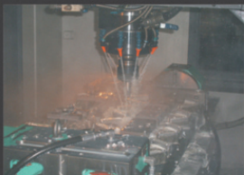
● CNC Miller processing