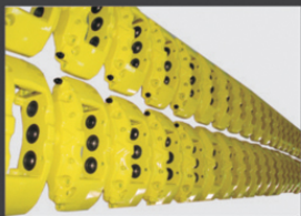
● Semi-finished goods