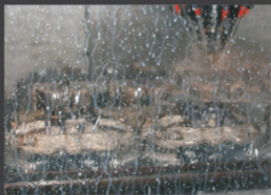
● CNC miller processing