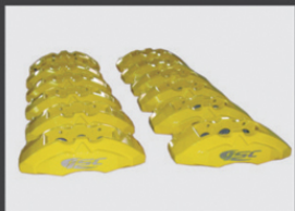
● Semi-finished goods