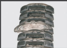
● Made of forged alloy 2024